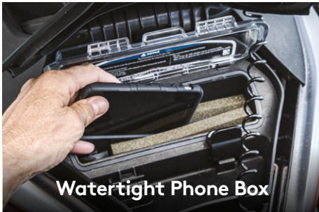
Watertight Phone Box

Exclusive quick-attach system on the largest swim platform in the industry allows for easy installation of storage accessories.