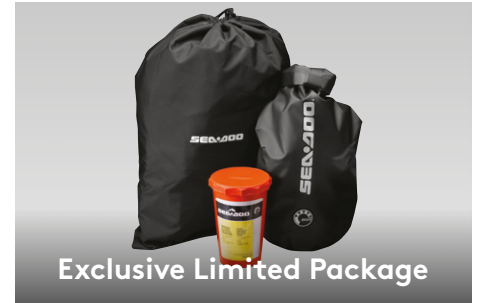
Exclusive Limited Package

An innovative hull that sets the benchmark for rough water handling, stability, and offshore performance.