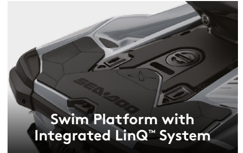
Swim Platform with Integrated LinQ™ System

The industry's first manufacturer-installed, truly waterproof, Bluetooth ‡ audio system.