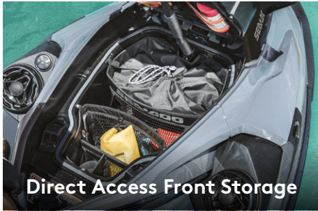
Direct Access Front Storage

Large front storage area that's easily accessible from a seated position. 1